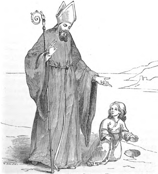
The Vision of S. Augustin ( Murillo ).